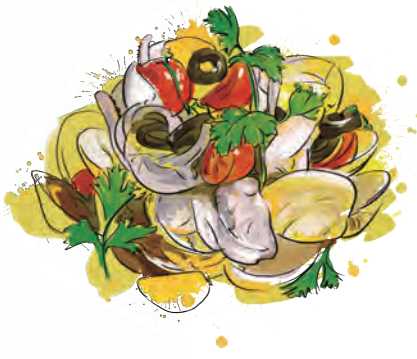
Calamari w/ Clam Wine Sauce 白酒蒜味蛤蜊炒軟絲 260