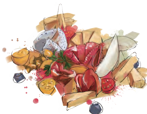
Charcuterie and Cheese Board