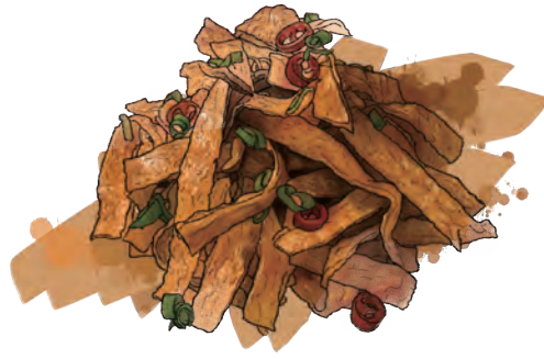
Deep Fried Fish Snacks 噫汁魚香 220