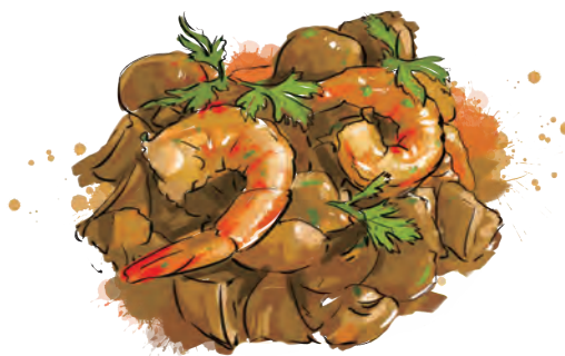
Spicy Stir Fry Mushroom and Shrimp