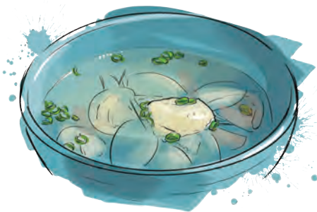
Scallop and Clam Soup w/ Bamboo Fungus 瑤柱竹筴蛤蜊清湯 280

All prices are subject to 10% service charge. Minimum consumption $800+10%, corkage fee $1500/bottle. Pork Origin : Spain. 以上價格皆須另加收一成服務費，每位低消$800+10%，開瓶費$1,500/瓶。豬原料來源：西班牙