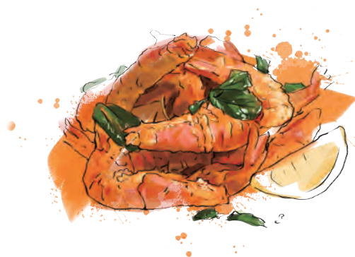
Spicy Deep Fried White Shrimp