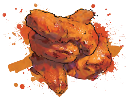
East End Fried Chicken Hot Wings