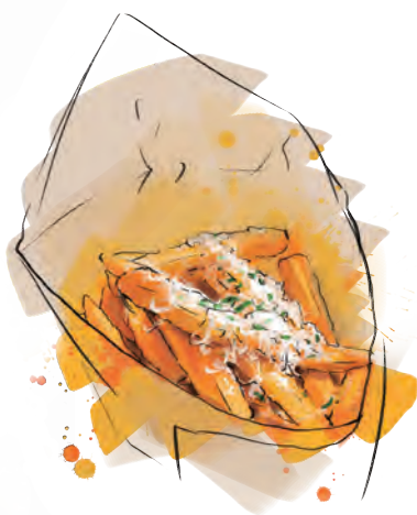
French Fries w/ Truffle Aioli